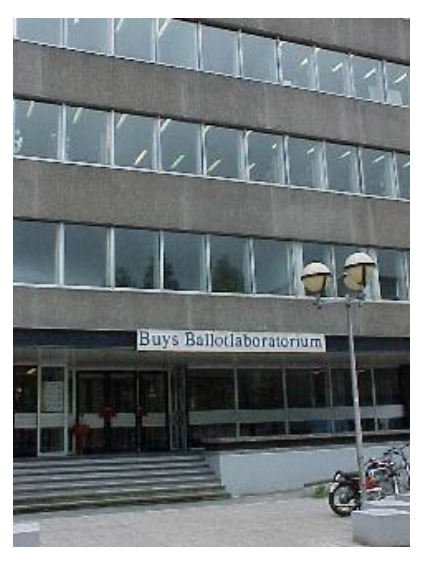
BUYS BALLOT LABORATORY