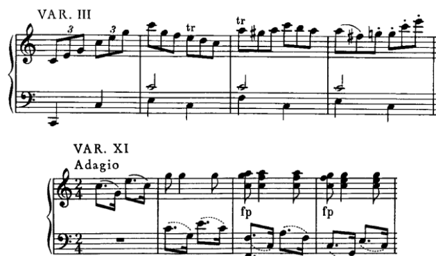
Figure 2. The beginning of two variations of the theme shown in Figure 1.

internal structure of those phrases can also show common features: the harmony is often similar; there can be common notes, especially in important positions like beginnings and endings, and the variation sometimes clearly gives a decorated version of the melody and/or bass of the original. Figure 2 shows the first four bars of two variations of the theme shown in Figure 1.